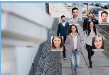
Offices and Facilities