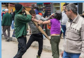
Violence or Fighting

Detection of sudden or anomalous variation of speed and/or acceleration of targets of interest within virtual areas