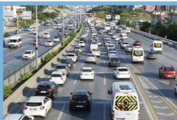
Traffic Jam Monitoring